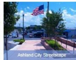
Ashland City Streetscape