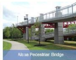
Alcoa Pedestrian Bridge